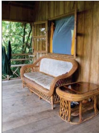
Rattan adds to the natural feel on the balcony of the guest bungalow.

The salt-water pool has an adults' section and a kids' paddling area with protective canopy. Around the pool's edges, sun-chairs and umbrellas are interspersed