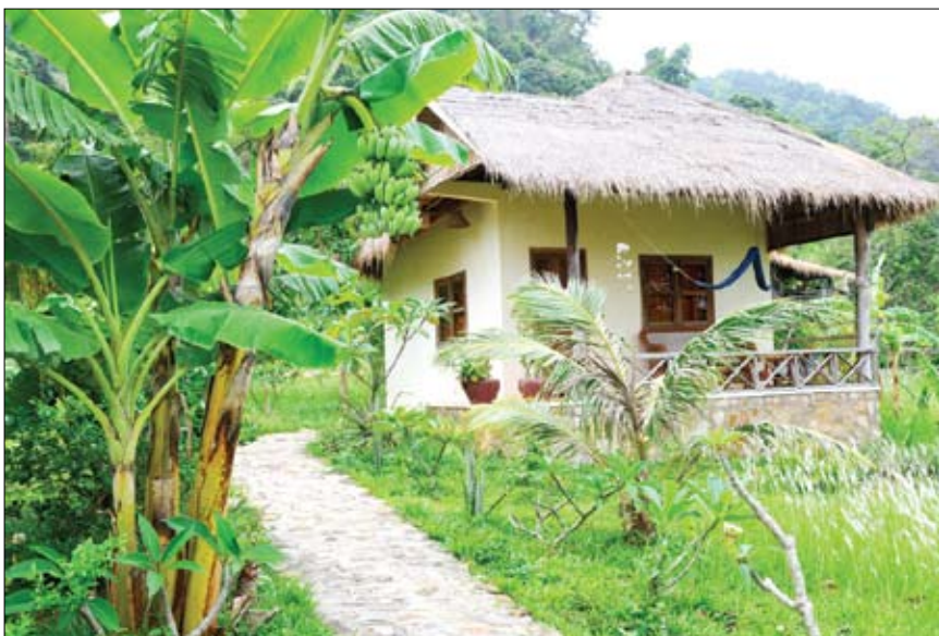
One of the six thatched-roof bungalows with views to Bokor Mountain.