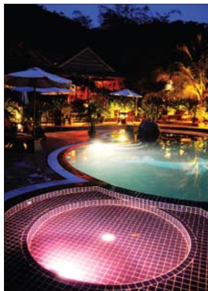
The infinity pool caters to the whole family.

"When the light starts to fade, all you can see is uninterrupted water. It appears as if water stretches from the pool, across the ocean and all the way to Bokor Mountain in the distance." WORDS AND PICTURES BY CONOR WALL